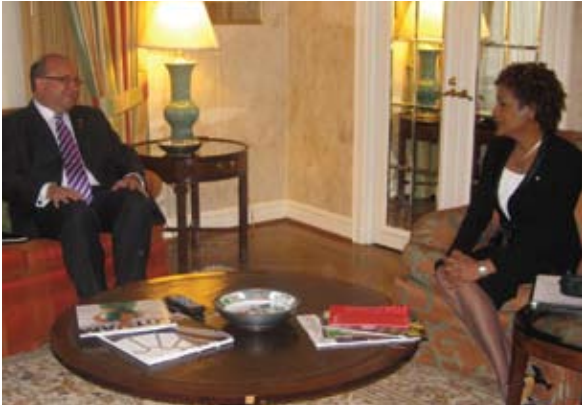
Meeting with former Governor-General Michaëlle Jean to discuss the role of Canadian municipalities in the reconstruction of post-earthquake Haiti.

“Representing Kitchener while serving as VP of FCM is a huge honour. It allows me to take some of our best practices in Kitchener and share them with colleagues across the country and internationally. It also allows me to learn from them, and bring some ideas back to our community, without reinventing the wheel.”