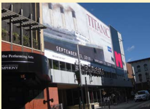
The Museum, together with the Conrad Centre for the Performing Arts has helped add to the Arts & Culture scene right in downtown Kitchener.

"Arts and culture is one of the significant factors influencing the quality of life in a community. A strong arts & culture sector allows our community to honour its past, celebrate the present and reflect on our dreams and aspirations for the future. The support of arts & culture is also an important element of economic development as many companies want to see a vibrant sector before relocating to an area."