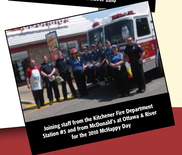
Joining staff from the Kitchener Fire Department Station #3 and from McDonald's at Ottawa & River for the 2010 McHappy Day

VOTING DAY Monday, October 25, 2010 10AM - 8PM