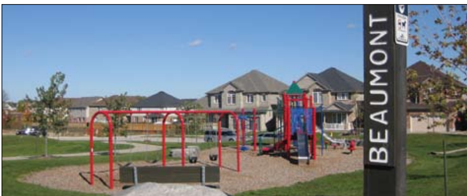
Beaumont Park is one of 3 new parks constructed in the ward during this current term.

"I want us to have safe, diverse and caring neighbourhoods, where we ensure we provide services for our youngest to our oldest and for our most needy to our most successful. I am committed to ensuring that we have the kinds of community facilities necessary such as community centres, arenas, libraries and parks and trails to encourage participation and healthy lifestyles for all residents."