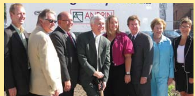
Groundbreaking for the sales centre for the new City Centre condominium development in Downtown Kitchener.