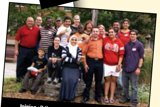
Joining all the community volunteers who helped with the Centreville-Chicopee Community Centre's 31st Anniversary Community Carnival and Fire Open House in October 2010