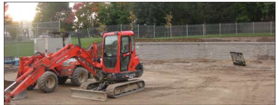
The new splash pad at the Centreville-Chicopee Community Centre under construction, to be completed this Fall and open in Summer 2011.