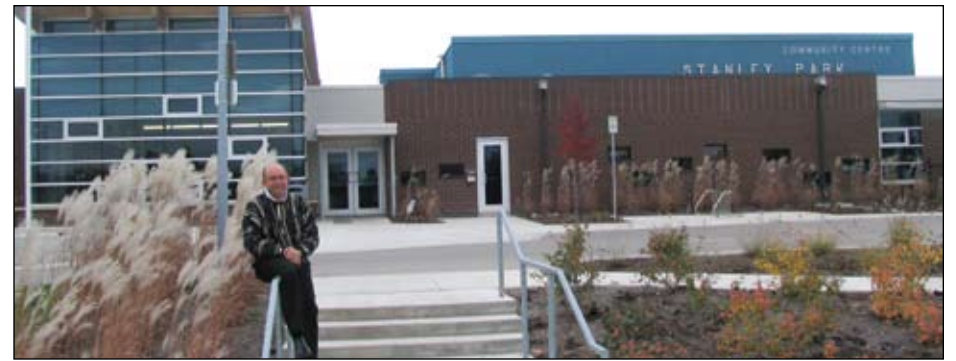
Construction of the Stanley Park Community Centre, which recently celebrated its 5th anniversary, was a highlight of my time on council.